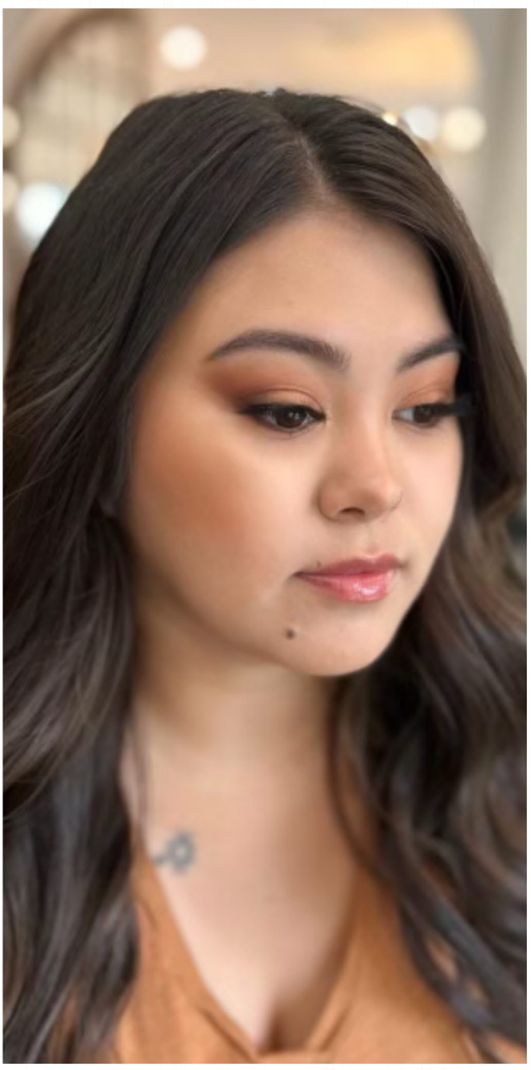
a bold eye