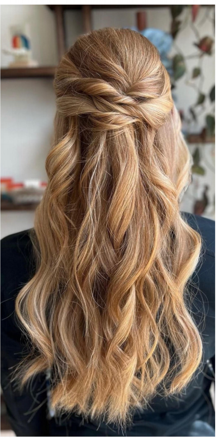
cute + casual