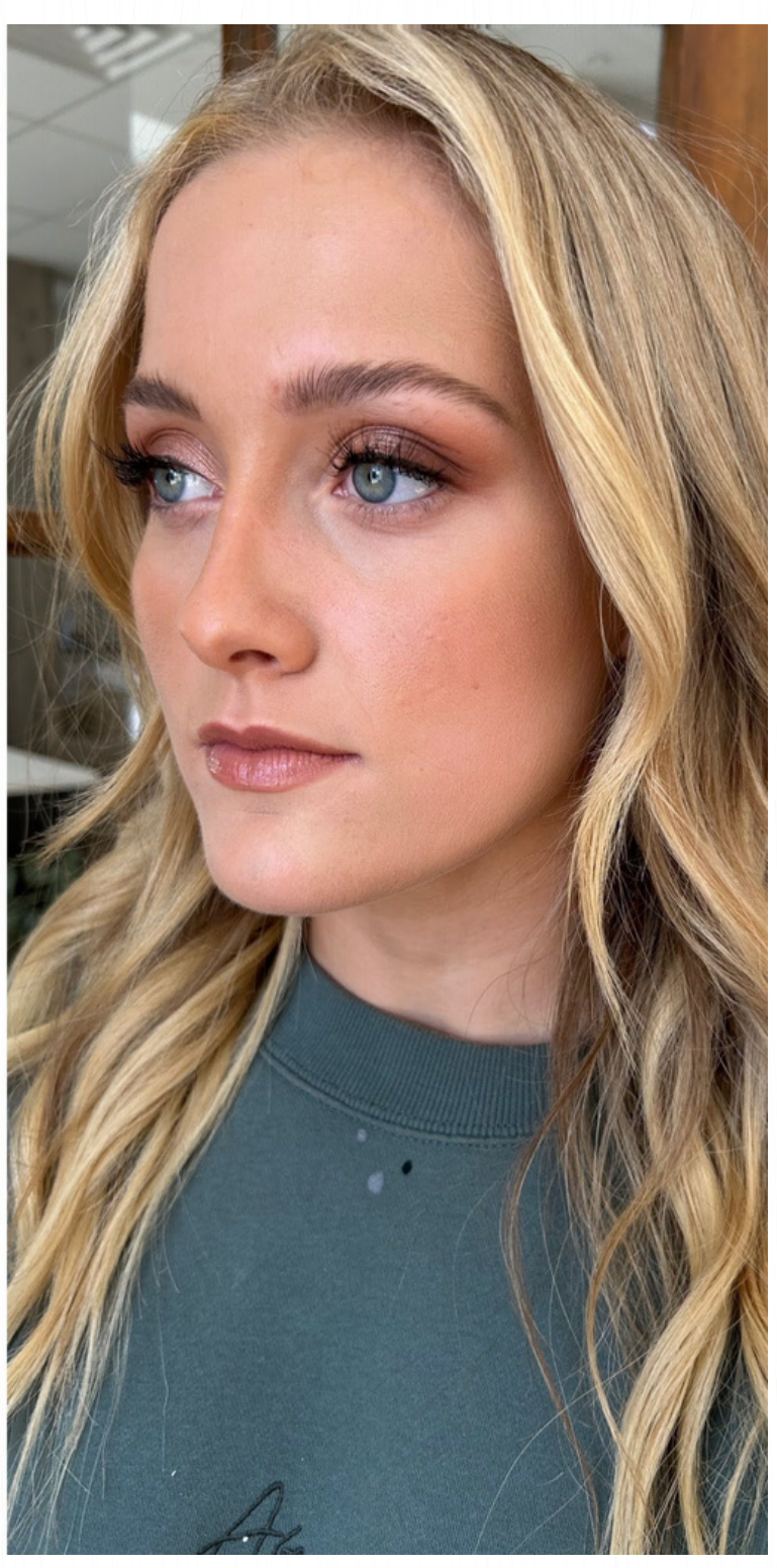
a splash of pink