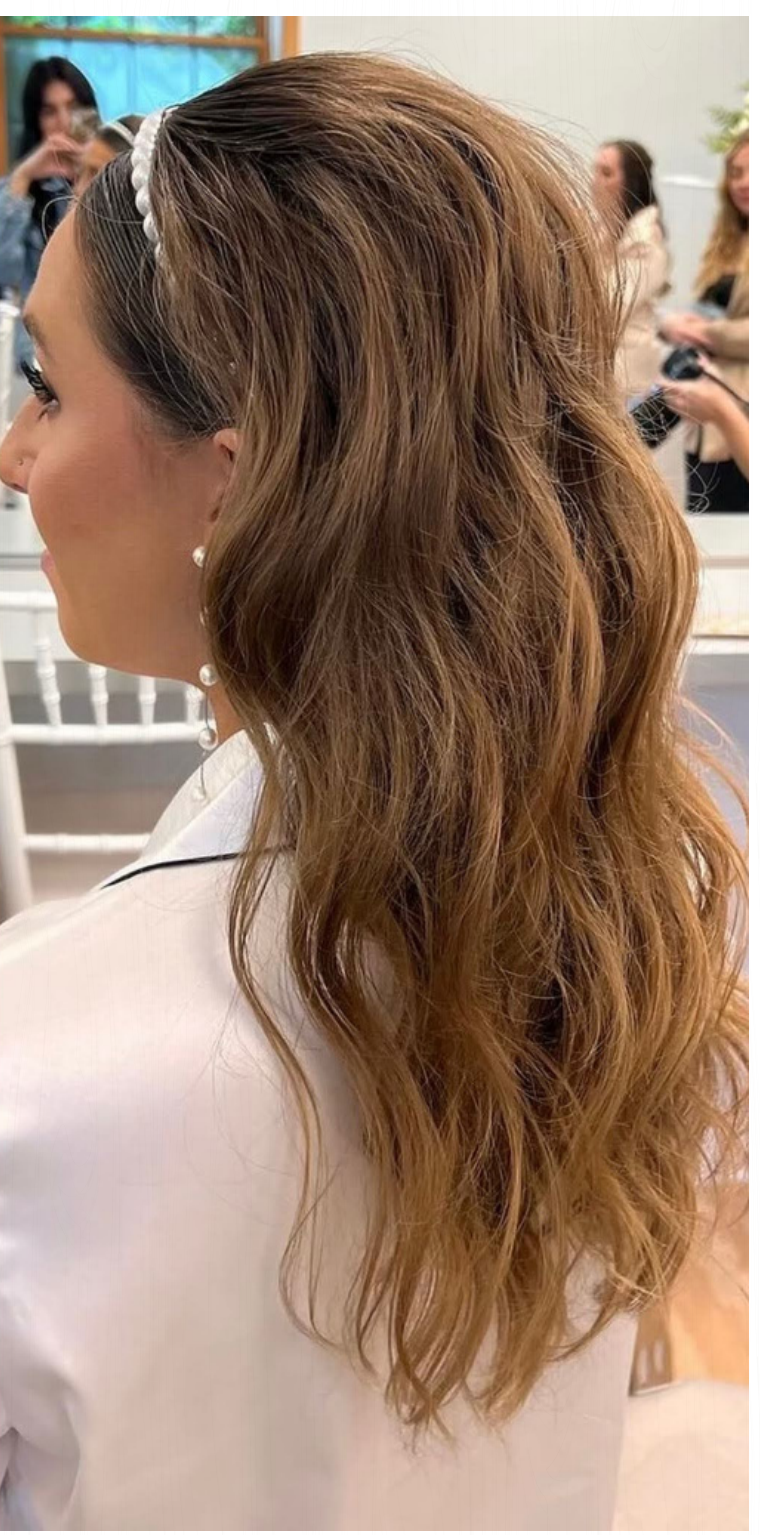
soft + romantic